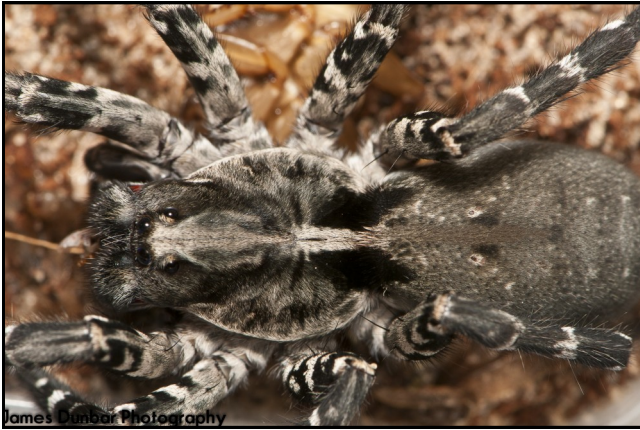
Figure 2. Hogna ingens .

This has had a dramatic affect on the spiders. When they were last surveyed in 2012 it was found that their area of occupancy had decreased by 81% since 2005, less than a decade earlier.