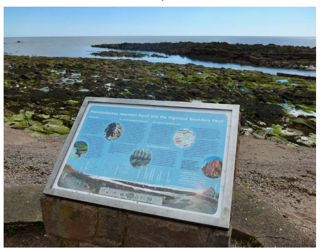
Figure 2: Cowie Harbour foreshore looking east. Information board giving details of the fossil bed and its millipedes. The fossil bed lies just beyond the inlet.

Figure 1: General view of Cowie Harbour, Stonehaven, Aberdeenshire, looking north-east. The Devonian Cowie Harbour Group form the foreshore exposures, beyond which the cliffs of Slug Head to Garron Point are composed of the older Highland Border Complex which abut the Highland Boundary Fault.