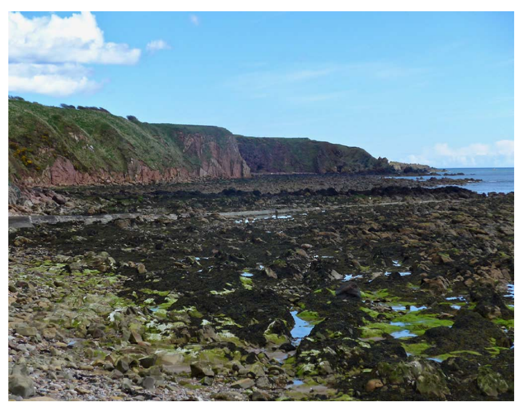
Figure 1: General view of Cowie Harbour, Stonehaven, Aberdeenshire, looking north-east. The Devonian Cowie Harbour Group form the foreshore exposures, beyond which the cliffs of Slug Head to Garron Point are composed of the older Highland Border Complex which abut the Highland Boundary Fault.