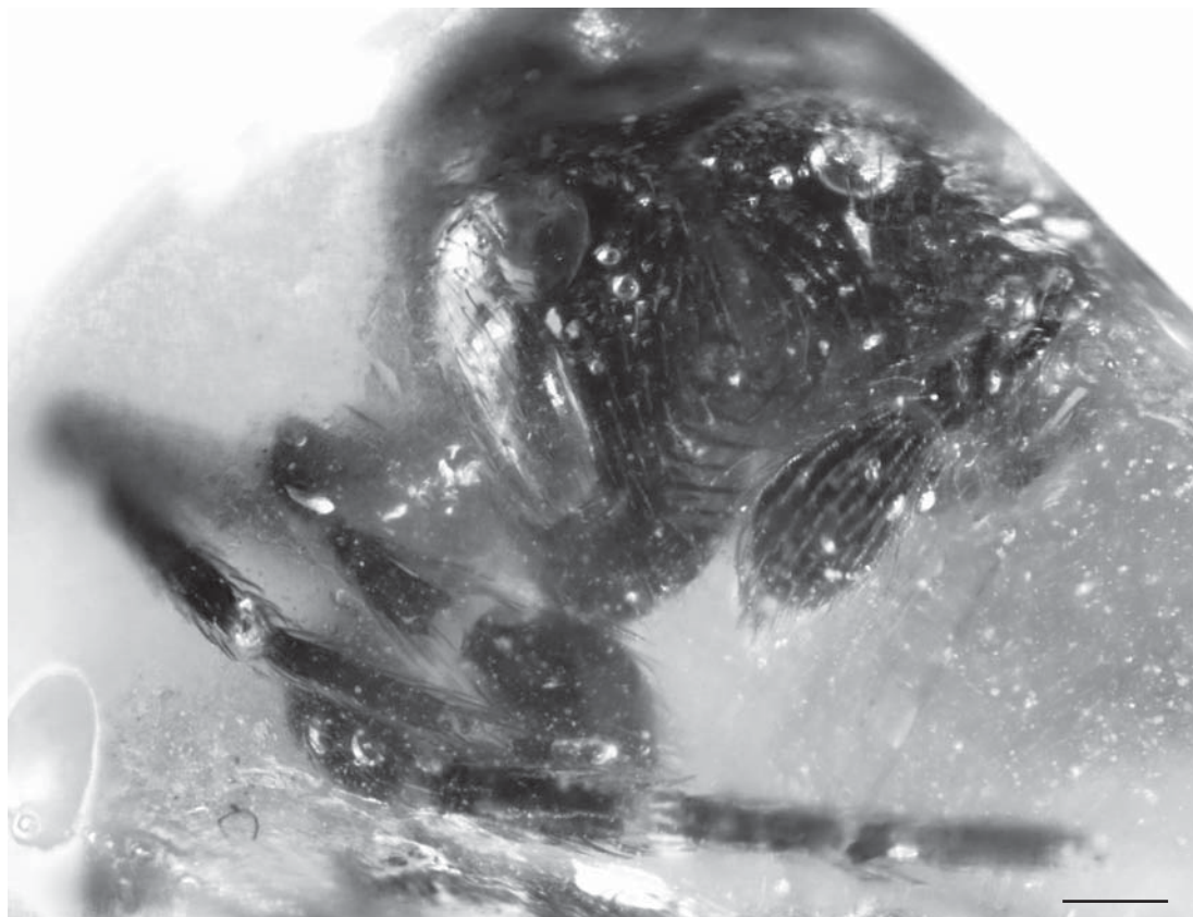
FIG. 3. — Archaemecys arcantiensis n. gen., n. sp., anterior view of the chelicerae and pedipalps. Notice the peg teeth on the chelicerae and the heightened profile of the carapace. Scale bar: 0.1 mm.

from a lack of informative characters used in the analysis and because we were dealing with family-level data that is possibly unnatural. For example, the tendency to lose spinnerets is prevalent within the Palpimanoidea: Palpimanidae, Stenochilidae, Huttoniidae and Mecysmaucheniidae all have a reduced number (Forster & Platnick 1984), but the Archaeidae (sister to the Mecysmaucheniidae and phylogenetically removed from many of the previously cited taxa) still retain the primitive six. It is important to note that the mecysmaucheniids are diagnosed by the combined characters of having only two spinnerets (a character present in other palpimanoid families) and chelicerae originating from a foramen in the carapace. The mosaic of characters found in palpimanoid taxa is reflected in