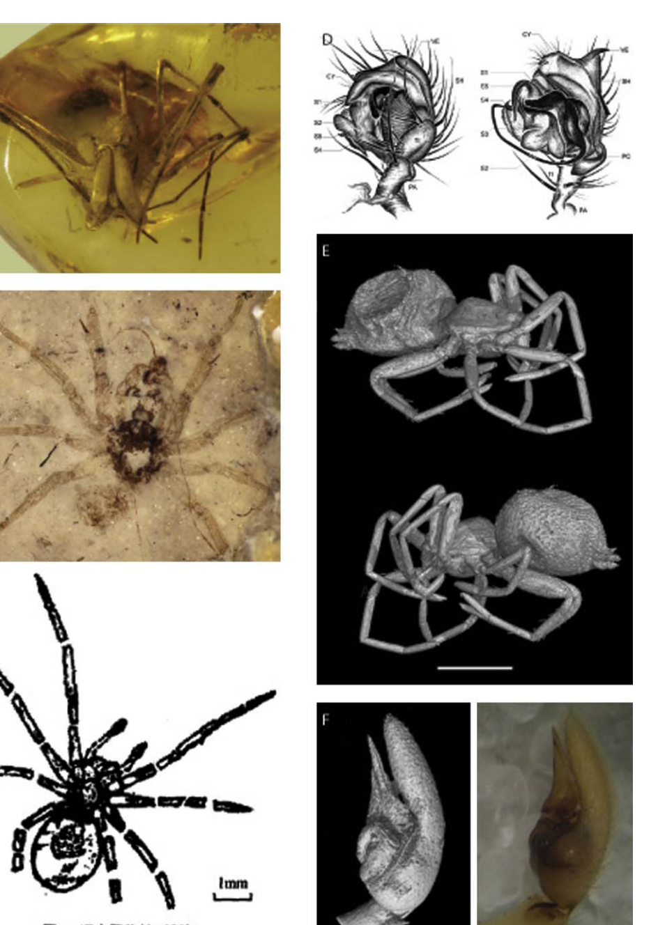
图 5 辽宁平腹蛛(新种) Gnaphosa liaoningensis sp. nov.